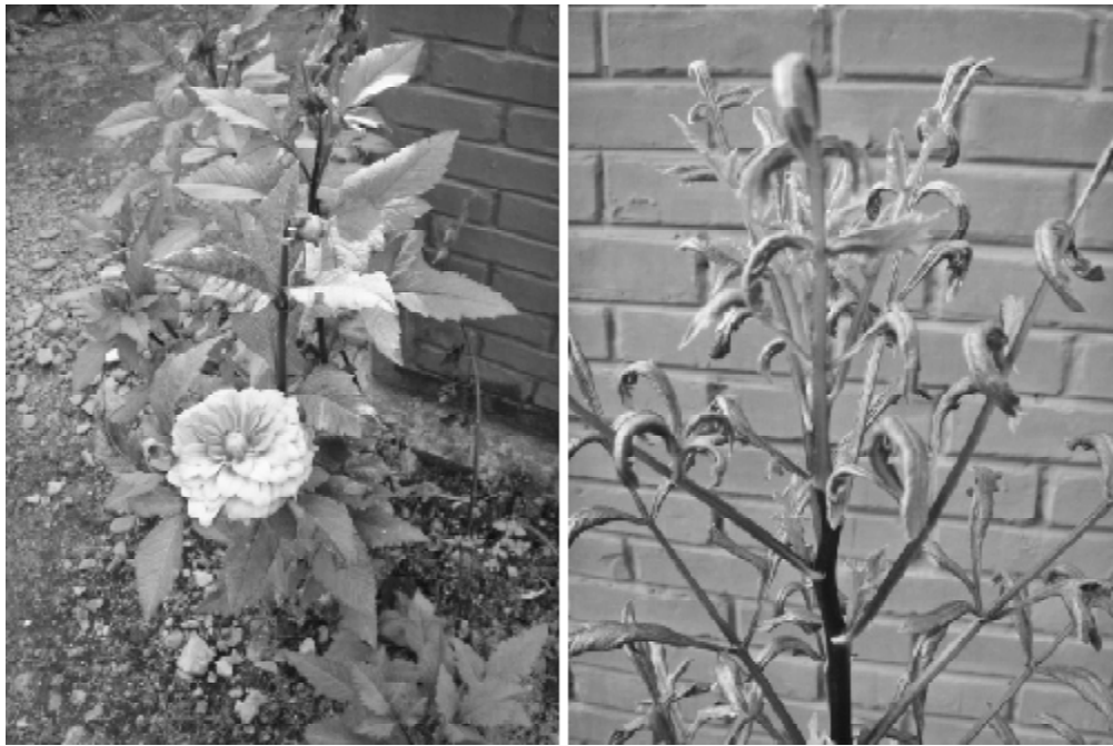
Fig.1a. Normal and thrips infected Dahlia plant